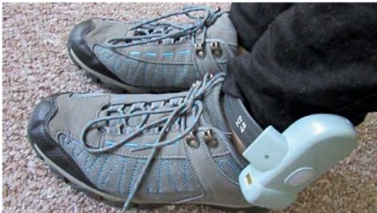
Figure 1: GPS electronic monitoring ankle tag.

The Ministry of Justice holds the contract for electronic monitoring services across government departments. Their main electronic monitoring contractor Capita runs Electronic Monitoring Services (EMS), with a further contractor (G4S) supplying the physical equipment they use [36]. Location data is communicated using Telefonica's mobile network to Airbus, who process and verify the data and present the information to Capita EMS [37]. The cost of GPS tagging has been estimated at £55 per wearer per day [38]. Concerns have been raised about poor battery life of GPS tags, devices failing to charge properly and individuals having to spend several hours a day waiting for it to charge [39].